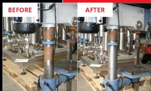
Before & after treatment with Innosoft B570